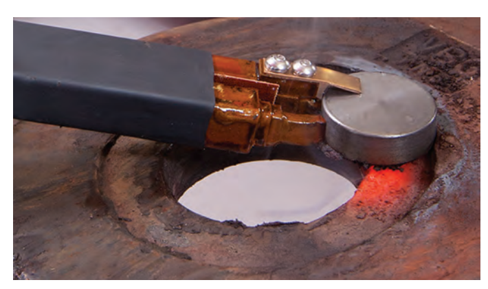
Heating of thick plates