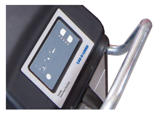
User friendly front panel with five power control levels.