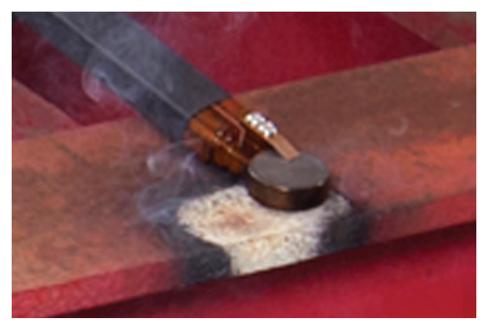
Heating is an important part of frame straightening